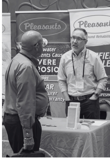
Exhibit Table - $1,500

Set up for success with our exhibit table option. Showcase your solutions throughout the duration of the event. Don't wait, our exhibit tables are limited and will sell out!