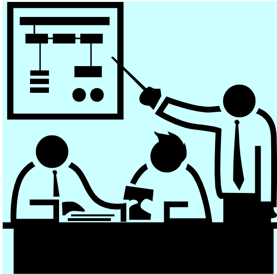
Structure of the city/town government

Elect a minimum of 3 to a maximum of 5 council members or commissioners and a mayor, burgess or president of the council/commission.